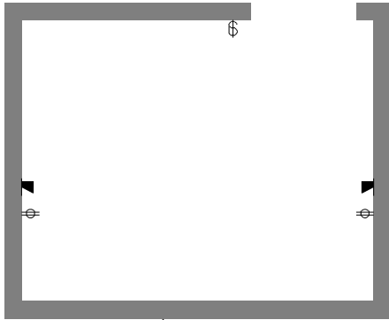
Detail 6.26.20-1: Typical Single Person Office Exterior Wall (no outlets)